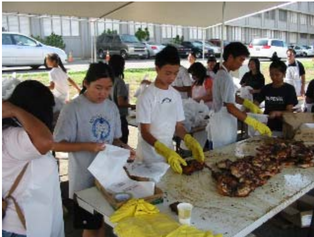
Chicken Fundraiser, October 2009

Marching Band and Orchestra Camps Winter and Spring Craft Fairs Winter and Aloha Concert Fiesta Bowl Parade