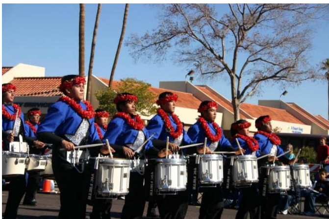
Fiesta Bowl Parade Trip, January 2010